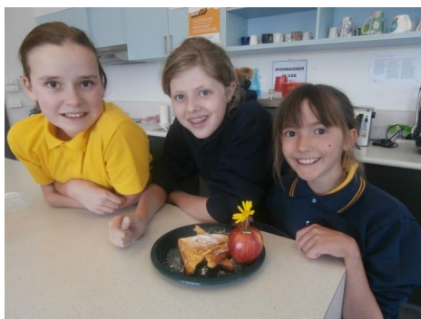
Chefs with a smile