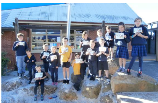
Students of the week

NAPLAN reports are now available for parents who have students in Year 3 and 5. These reports can be picked up by our parents at the office from Thursday afternoon. To keep disruptions to a minimum we ask that parents try to arrange pick up before or after school where possible. Students will not be issued with these reports. We have seen reports lost or damaged when given out this way. A page explaining how the report is presented and reads has been provided with the student report.