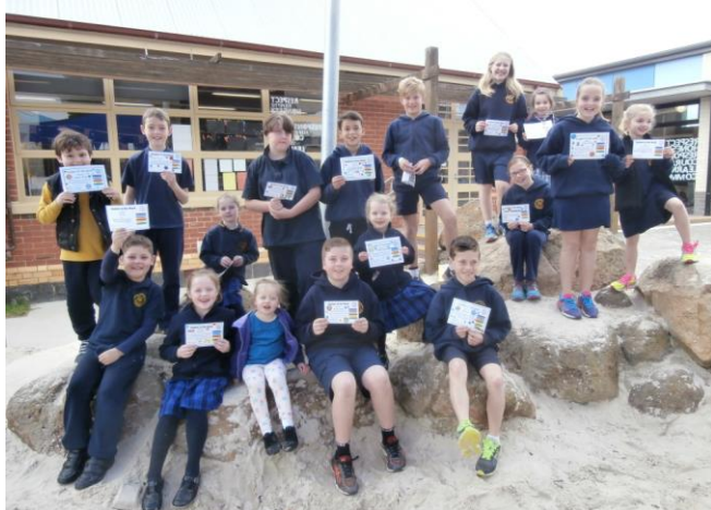
Students of the week