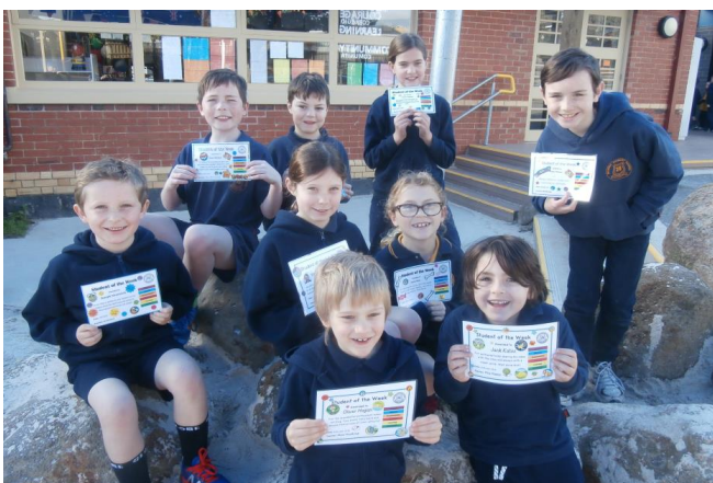
Students of the week