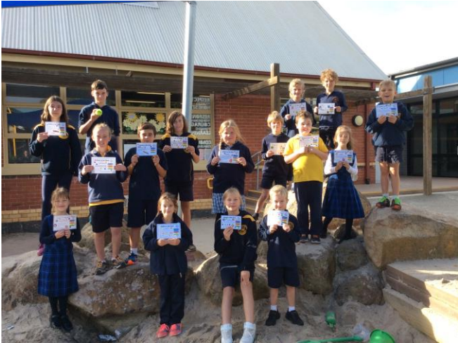
STUDENTS OF THE WEEK